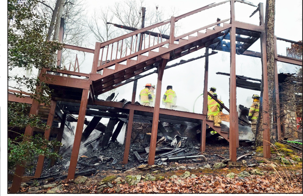
Firefighters working to extinguish the last remnants of the fire that claimed this East Chicory Drive vacation rental on Jan. 13.

Dyer suspects the Christmas Day fire started from a crack in the chimney, and he advises people to inspect "We had six structure fires and clean their chimneys on a routine basis